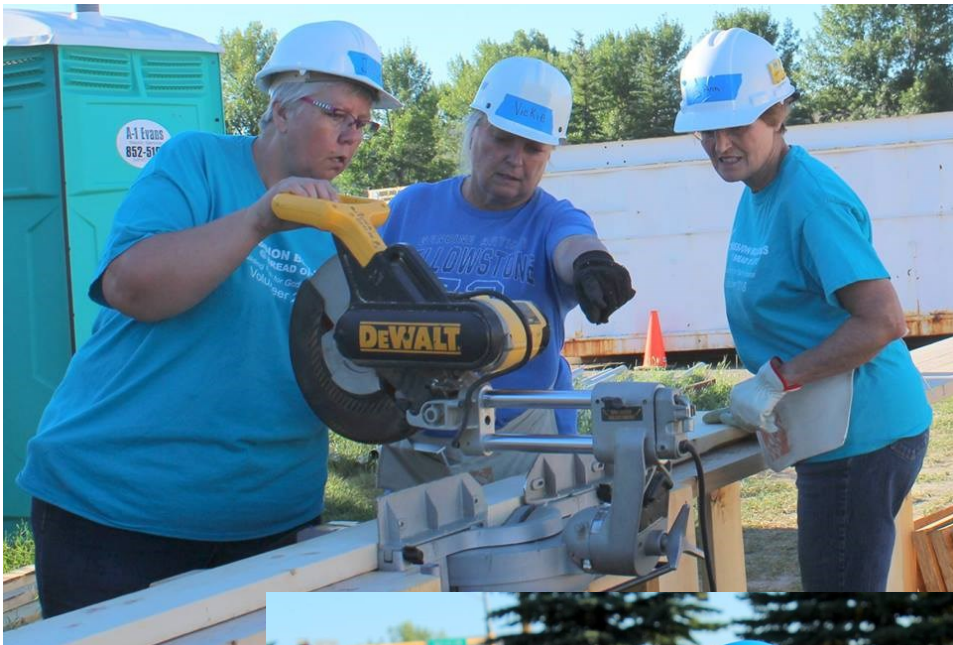
Ladies above learning safe miter saw operation.