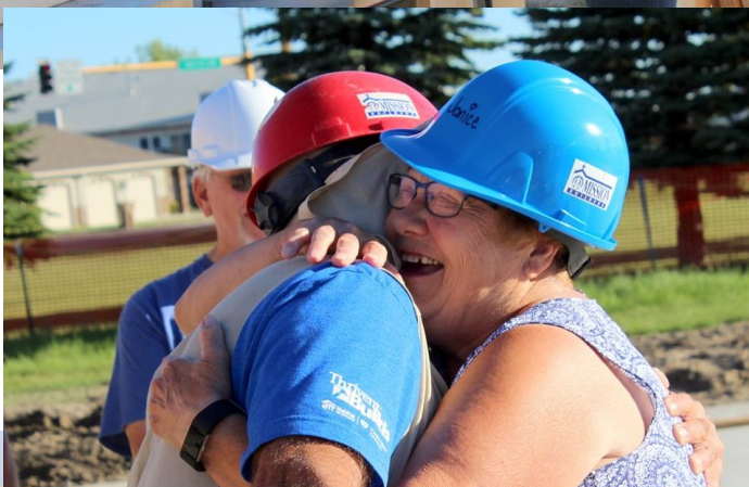
Busy day with volunteers building walls.