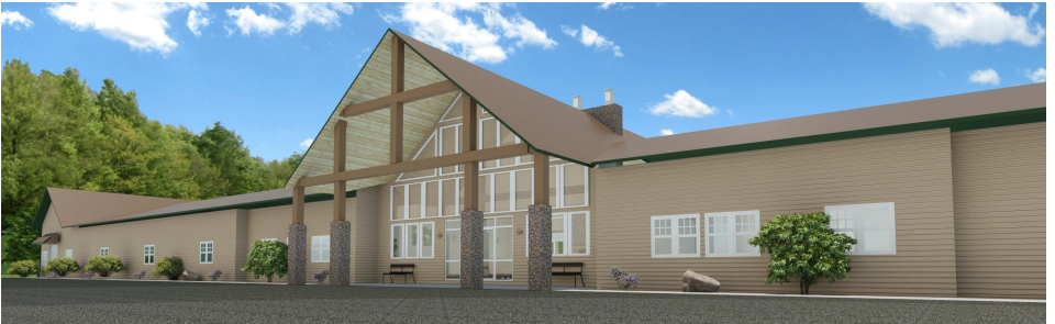
LUTHERDALE LODGE Main Floor

Lutherdale Lodge & Conference Center located on Lauderdale Lake north of Elkhorn, WI is a 21,000 sq ft lodging and conference facility. Scheduled start date is May 15th. Currently we anticipate the need for five builders. Less than an hour from Madison & Milwaukee. There is a lot to do in the area besides boating, fishing, hiking, & eating local foods.